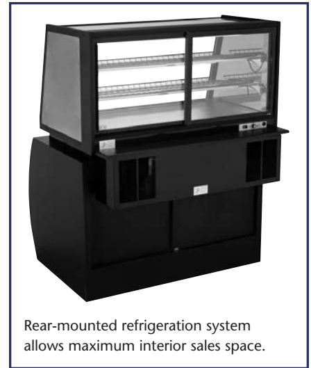
Rear-mounted refrigeration system allows maximum interior sales space.