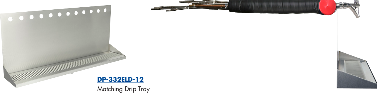
Faucet knobs not included.