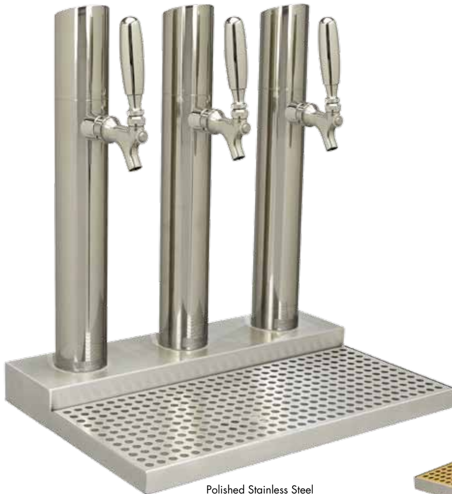
Polished Stainless Steel BS-SKY-3PSSKR-LR