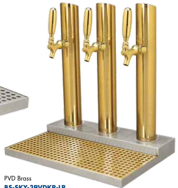
PVD Brass BS-SKY-3PVDKR-LR