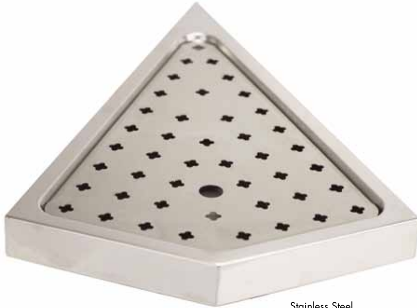
Stainless Steel DP-1601