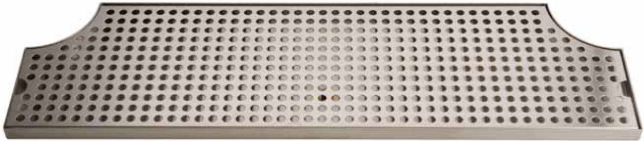
Stainless Steel DP-MET-H-28