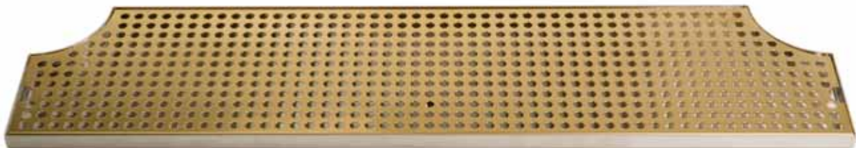
PVD Brass DP-MET-H-SSPVD-34