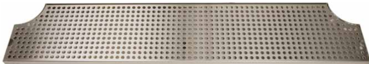
Stainless Steel DP-MET-H-40