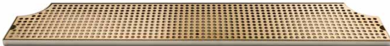
PVD Brass DP-MET-H-SSPVD-40