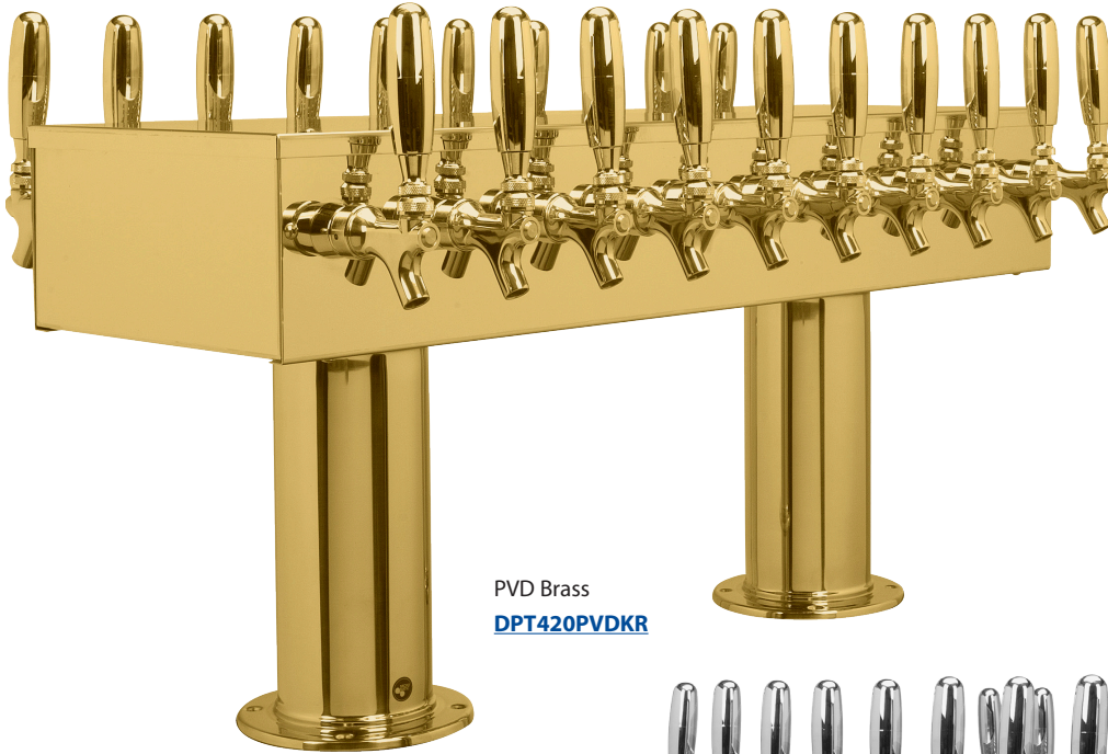
PVD Brass DPT420PVDKR