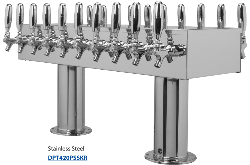
Stainless Steel DPT420PSSKR