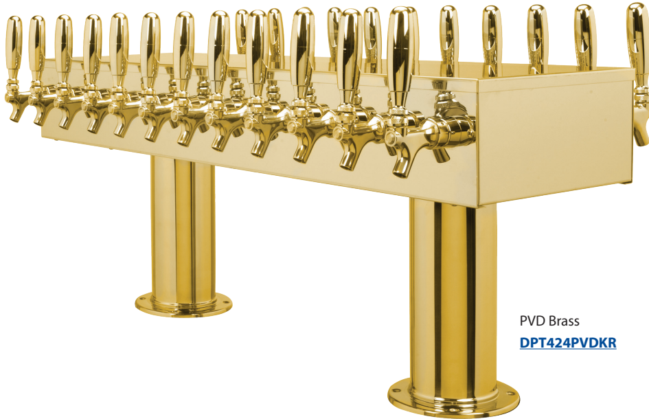
PVD Brass DPT424PVDKR