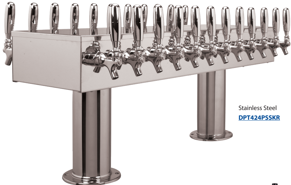
Stainless Steel DPT424PSSKR