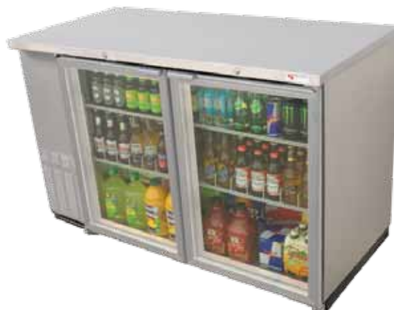
Stainless Steel with Glass Doors