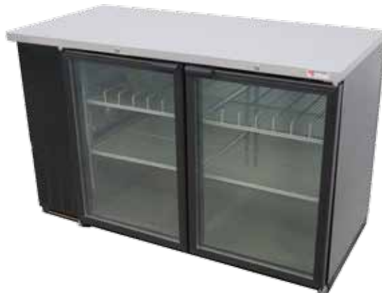
Black with Glass Doors