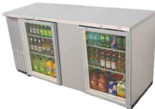
Stainless Steel with Glass Doors