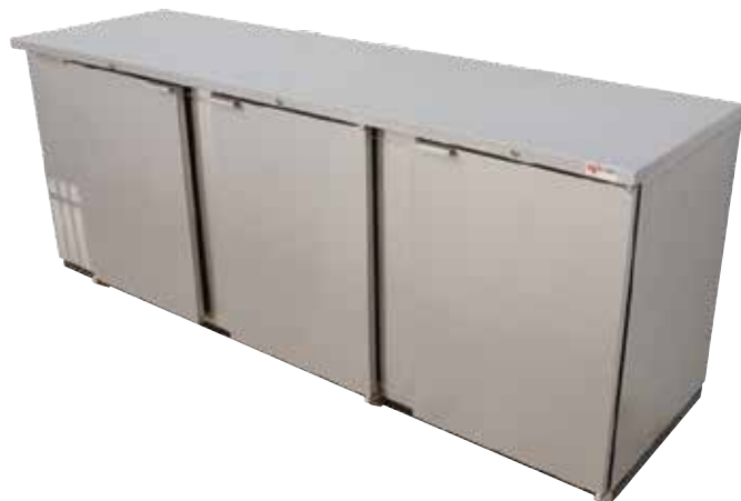
Stainless Steel MBB94S