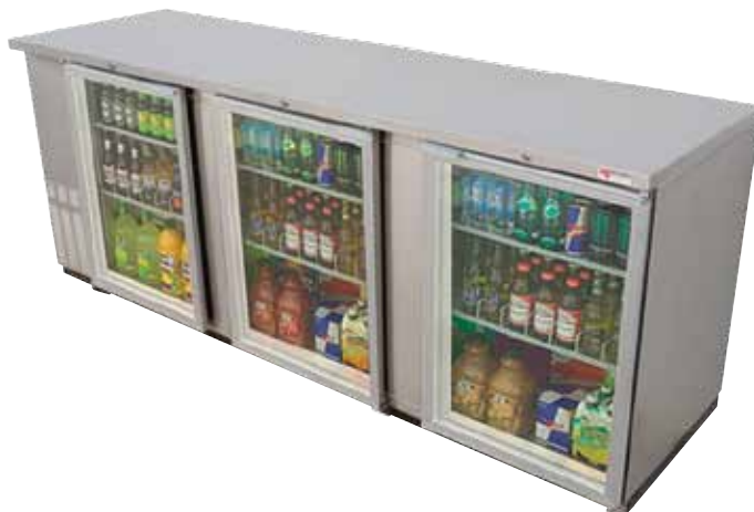
Stainless Steel with Glass Doors MBB94GS