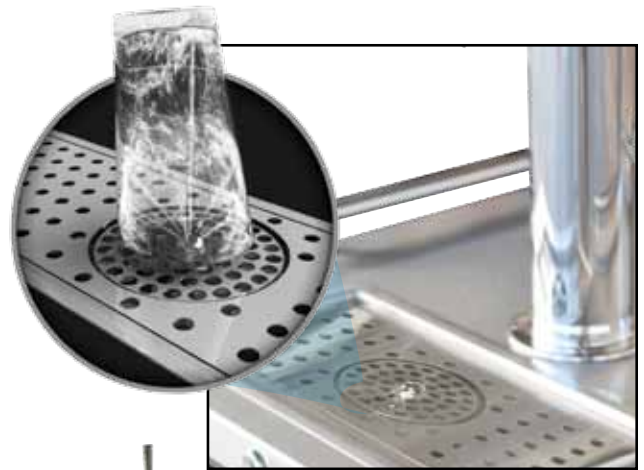
▶ Integrated cold water glass rinser.