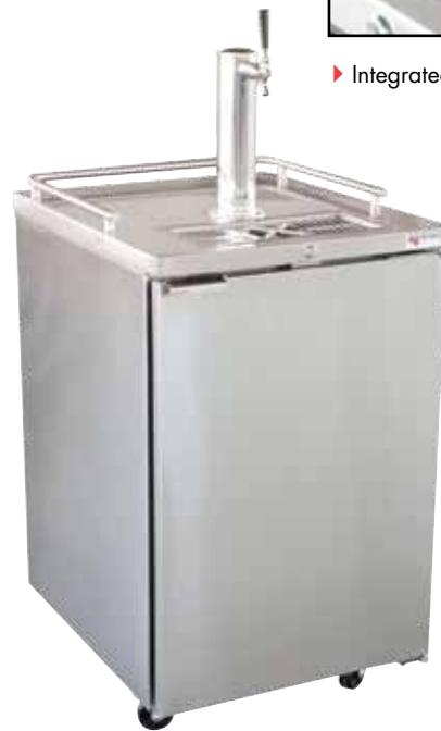
Stainless Steel with Glass Rinser