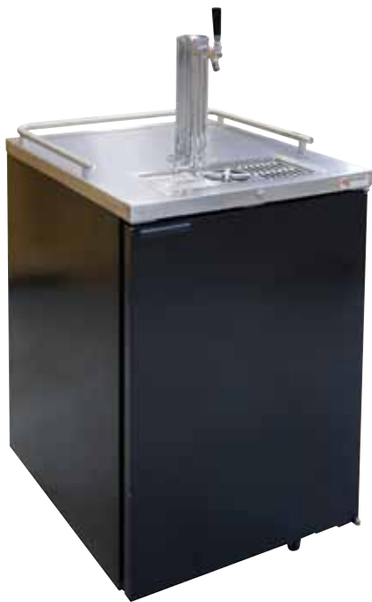
Black with Glass Rinser