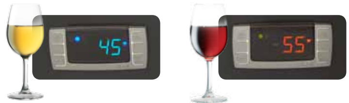
► Dual Temperature: Built In Digital Thermostats.