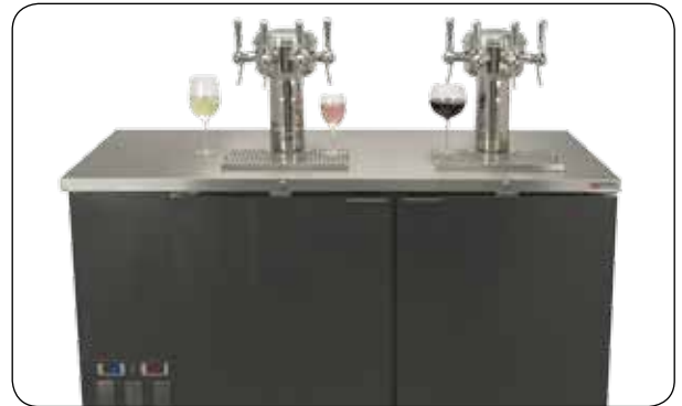
► Shown: 2 Wine Fonts MTM-4PSS-W, 2 Drip Trays DP-1020. Order separately.