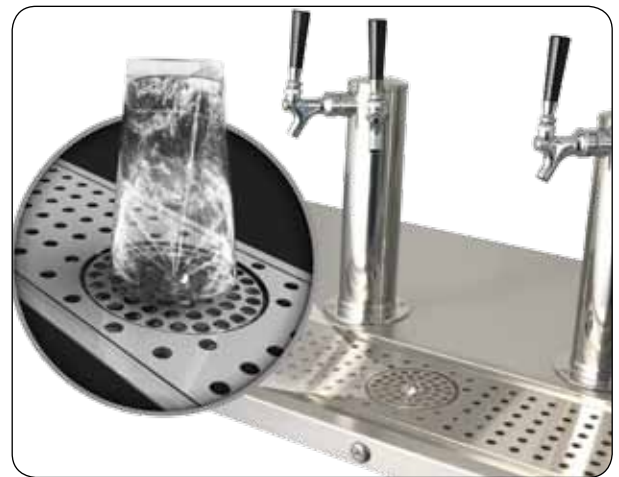
▶ Integrated cold water glass rinser.