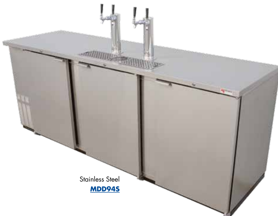
Stainless Steel MDD94S