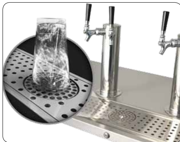
▶ Integrated cold water glass rinser.