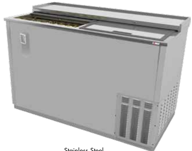
Stainless Steel MDW50S