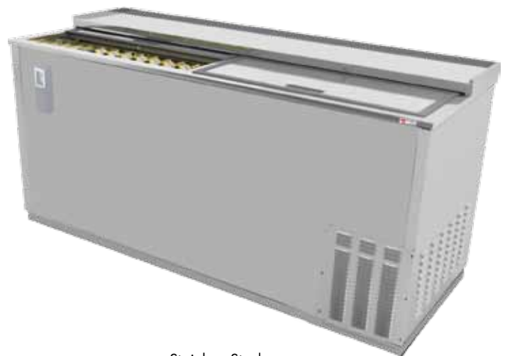
Stainless Steel MDW69S