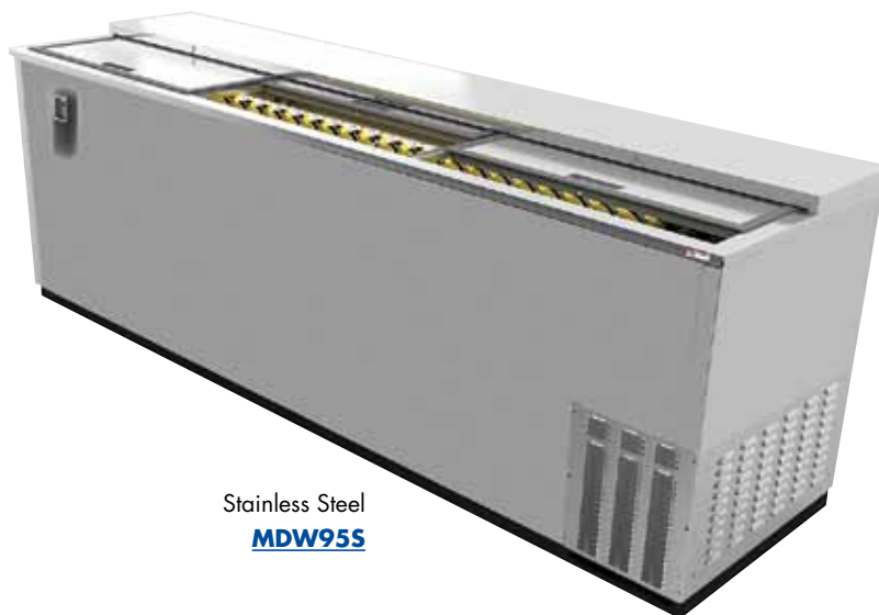
Stainless Steel MDW95S