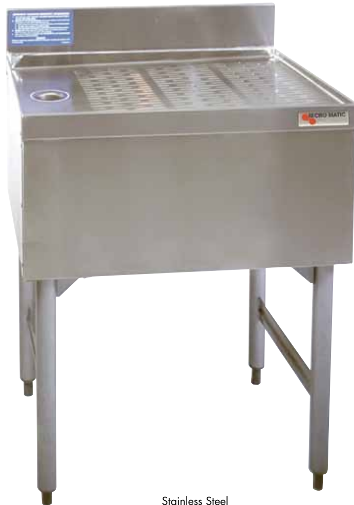
Stainless Steel MM-SDW24