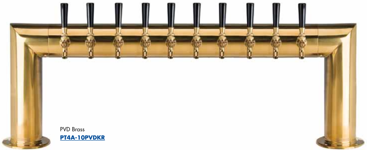
PVD Brass PT4A-10PVDKR