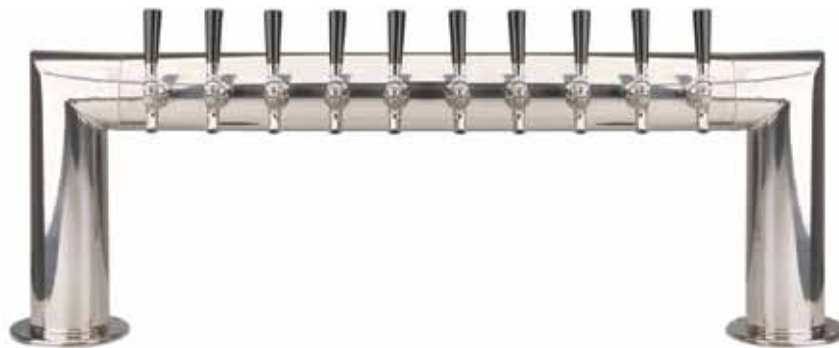
Stainless Steel PT4A-10PSSKR