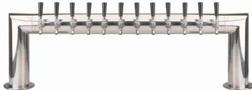
Stainless Steel PT4A-12PSSKR