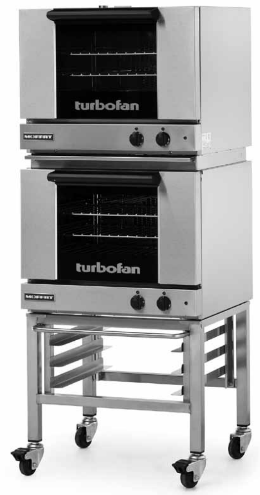
Model E22M3/2C shown