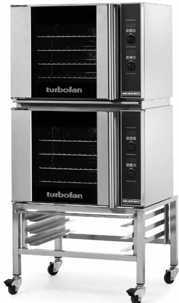
Model E31D4/2C shown