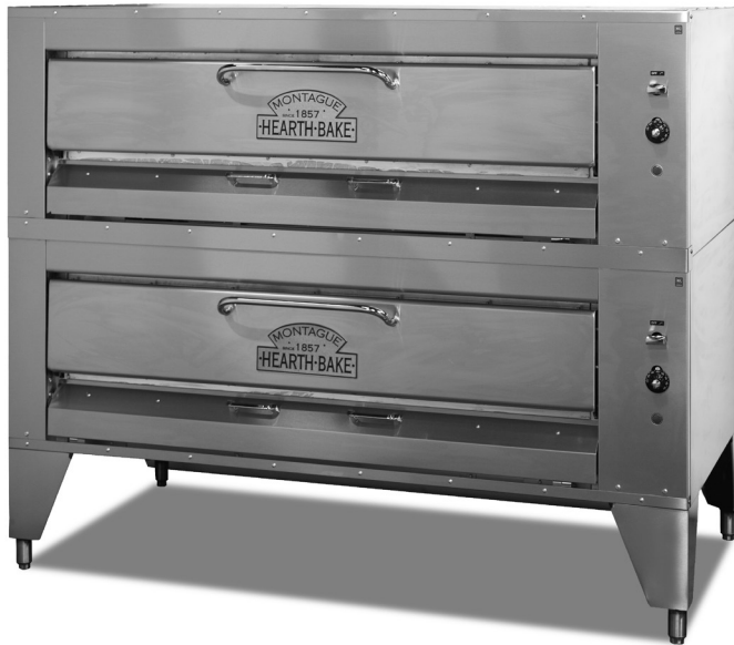
Model 24P-2 Shown with standard stainless steel front and 15" (381 mm) gusset-style legs.