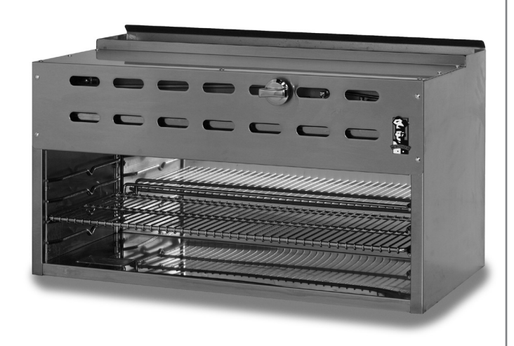
Model CM36 Shown