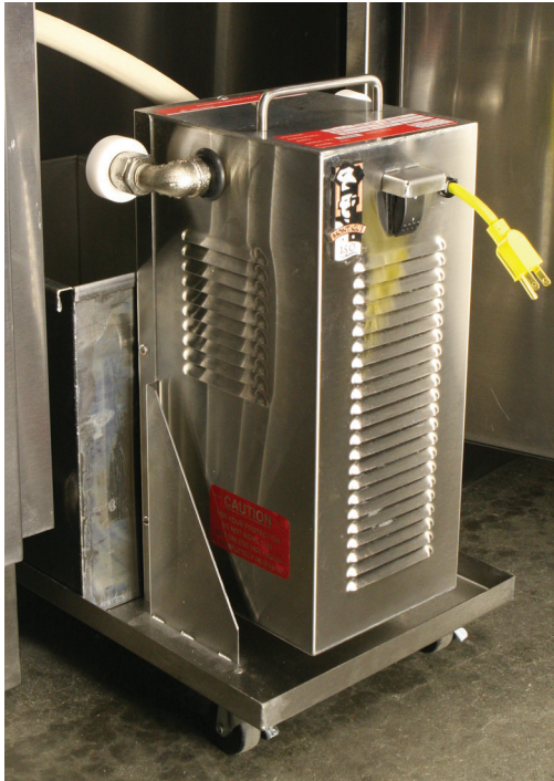
Model RD18 with filter