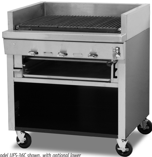
Model UFS-36C shown, with optional lower warming-finishing rack