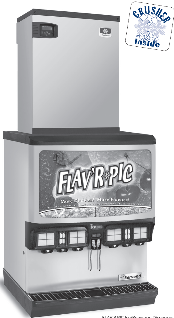
FLAV'R PIC Ice/Beverage Dispenser with IB-800 Ice Machine

FLAV'R PIC™ 250 Multi-flavor Ice/Beverage Dispenser with Selectable Ice