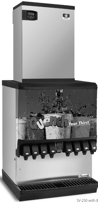
SV-250 with IB1090C Ice Machine