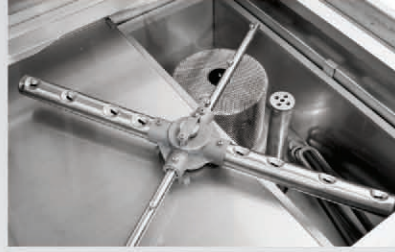
INNER WASH TANK Stainless steel wash and rinse arms are easily removed for cleaning.