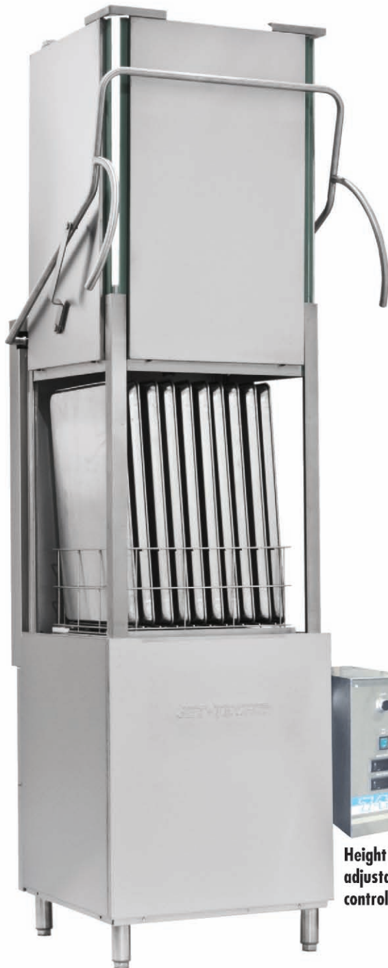
Height adjustable control panel

High-temp deluxe high hood door type warewasher