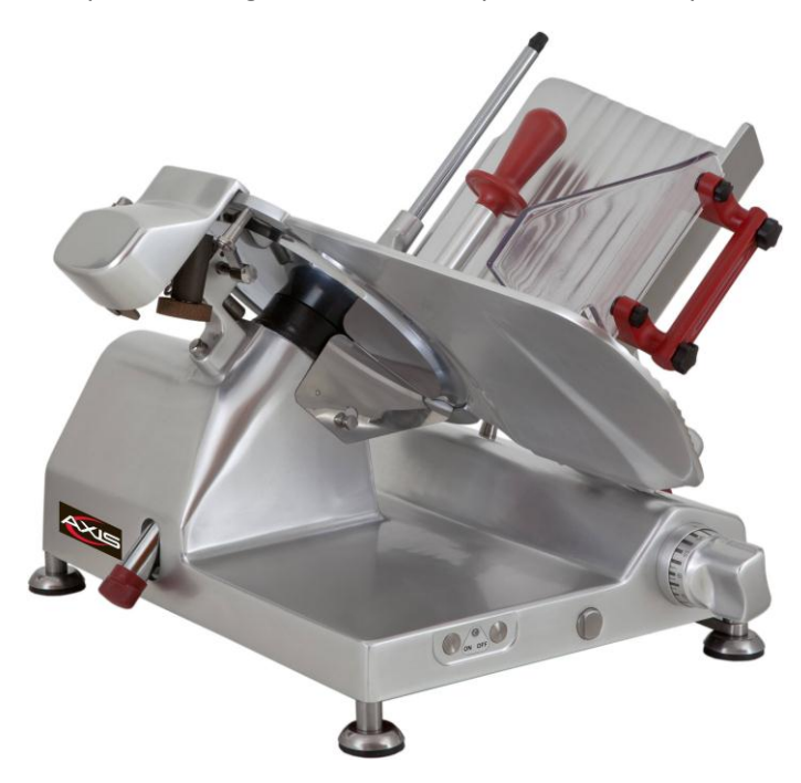
WARRANTY: One year parts and labor on site