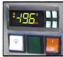
DIGITAL CONTROLLER WITH HIGH HEAD ALARM ON SELF CONTAINED