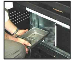
PULL OUT EVAP PAN FOR EASY CLEANING ON SELF CONTAINED