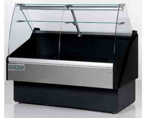
ALL "KPM" AND "KFM"