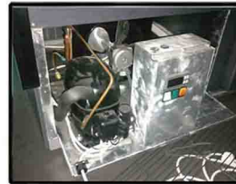
PULL OUT CONDENSING UNIT ON SELF CONTAINED