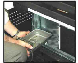
PULL OUT EVAP PAN FOR EASY CLEANING ON SELF CONTAINED