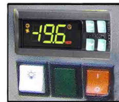
DIGITAL CONTROLLER WITH HIGH HEAD ALARM ON SELF CONTAINED