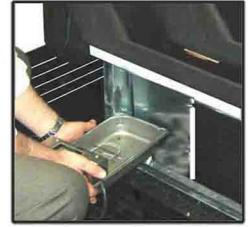
PULL OUT EVAP PAN FOR EASY CLEANING ON SELF CONTAINED