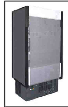
PULL DOWN NIGHT CURTAIN