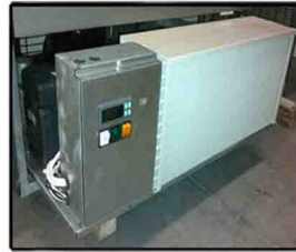
PULL OUT CONDENSING UNIT