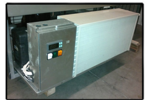
PULL-OUT CONDENSING UNIT, CONTROL PANEL AND EVAP PAN