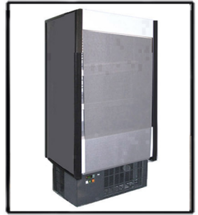
PULL DOWN NIGHT SHADE