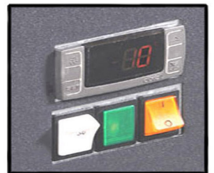
DIGITAL CONTROLLER WITH HIGH PRESSURE ALARM