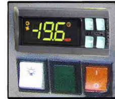
DIGITAL CONTROLLER WITH HIGH HEAD ALARM ON SELF CONTAINED