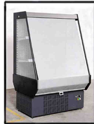
PULL DOWN NIGHT CURTAIN