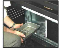
PULL OUT EVAP PAN FOR EASY CLEANING ON SELF CONTAINED