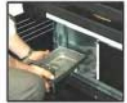
PULL OUT EVAP PAN FOR EASY CLEANING ON SELF CONTAINED