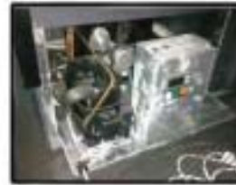
PULL OUT CONDENSING UNIT ON SELF CONTAINED