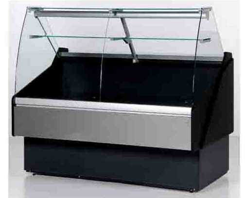
KPM AND KFM