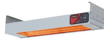
Model 6150-24, with hanging brackets