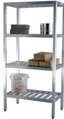
All Welded Shelving - T-Bar Series

These shelving units carry a Lifetime Guarantee against rust and corrosion and also carry a Lifetime Guarantee against workmanship and material defects.