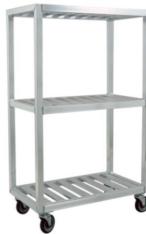
All Welded Shelving- T-Bar Series Mobile