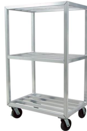
Mobile- All Welded Unit

These shelving units carry a Lifetime Guarantee against rust and corrosion and also carry a Lifetime Guarantee against workmanship and material defects.