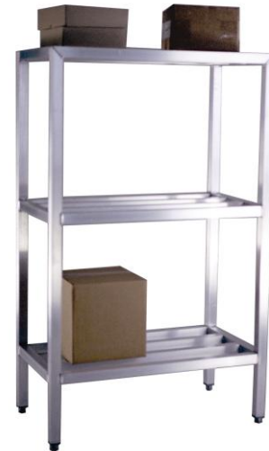
Stationary- All Welded Unit