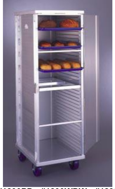
#1290PP • #1290WDW • #1292 Enclosed Pan Rack

All units carry a Lifetime Guarantee against rust and corrosion as well as a Five-Year Guarantee against material defects and workmanship.