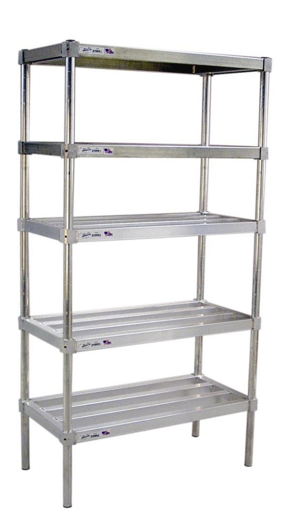
Adjust-A-Shelf - H.D. Series