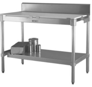
Poly Top Table with Backsplash