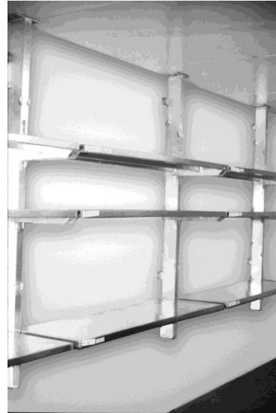
Wall/Ceiling Mounted Unit