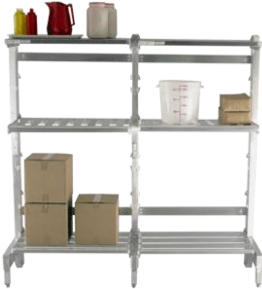
Free Standing Unit