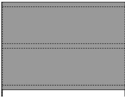
Solid Brute Shelf – 700# Wt. Capacity