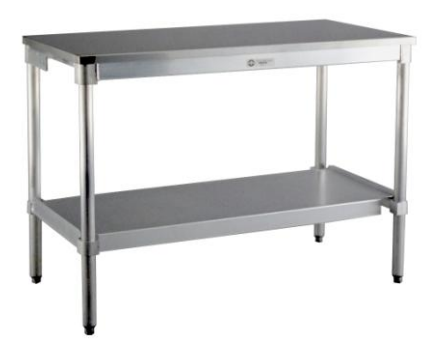
Stainless Steel Top with Undershelf

These tables carry a Lifetime Guarantee against rust and corrosion and also carry a Five-Year Guarantee against workmanship and material defects.