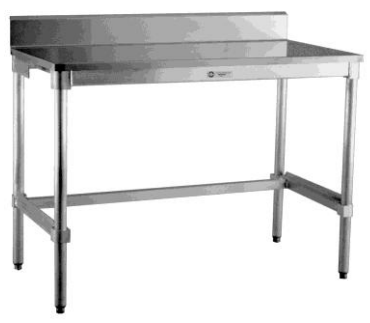
Stainless Steel Top with Backsplash