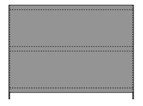
Solid Brute Shelf – 700# Wt. Capacity