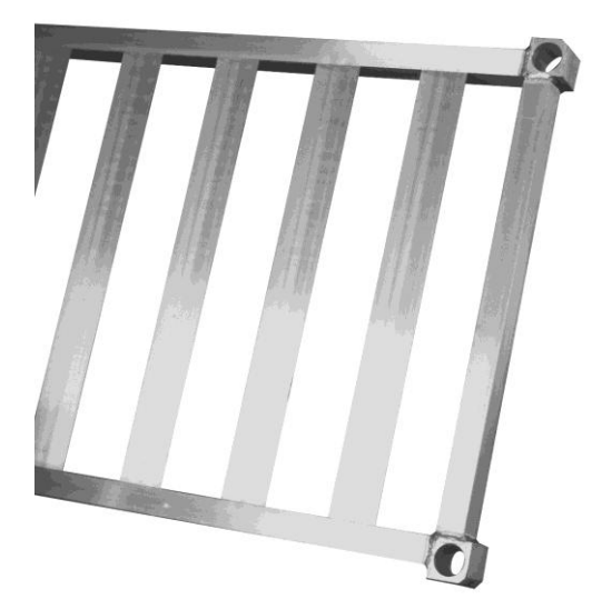
T-Bar Style Shelf

These shelves carry a Lifetime Guarantee against rust and corrosion and also carry a One-Year Guarantee against workmanship and material defects.